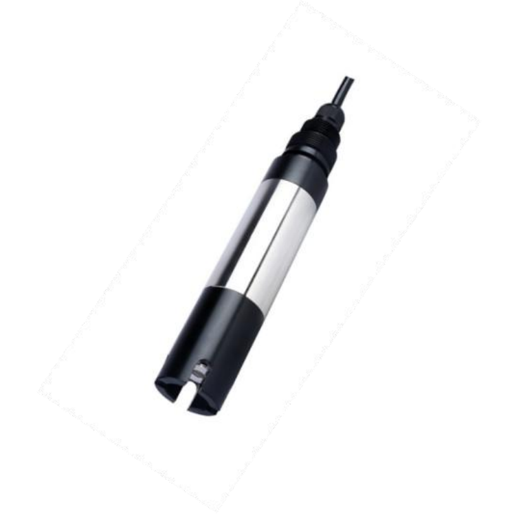
SUP-DO-7011 Dissolved Oxygen sensor

SUP-DO-7011 type oxygen electrode with high stability and stress resistant, can be used in a more harsh environment, maintenance volume is smaller, suitable for urban sewage treatment, industrial wastewater treatment, aquaculture and environmental monitoring and other fields of continuous measurement of dissolved oxygen.